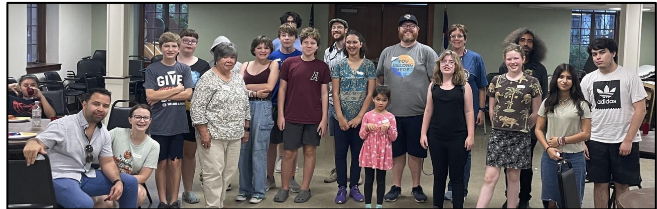
Top photo: youth and sponsors at McKinney Falls State Park, June 2022; bottom photo: Youth Fellowship with CPC, Round Rock Presbyterian Church, and Shepherd of the hills.