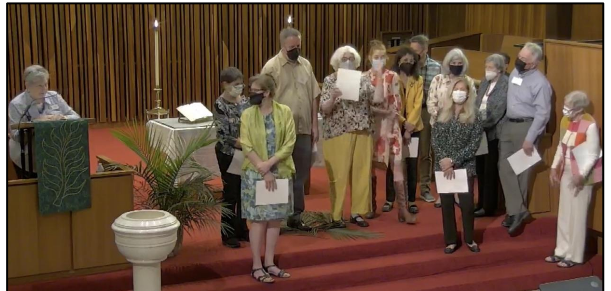
Kerygma Bible Study students receive completion certificates in worship.