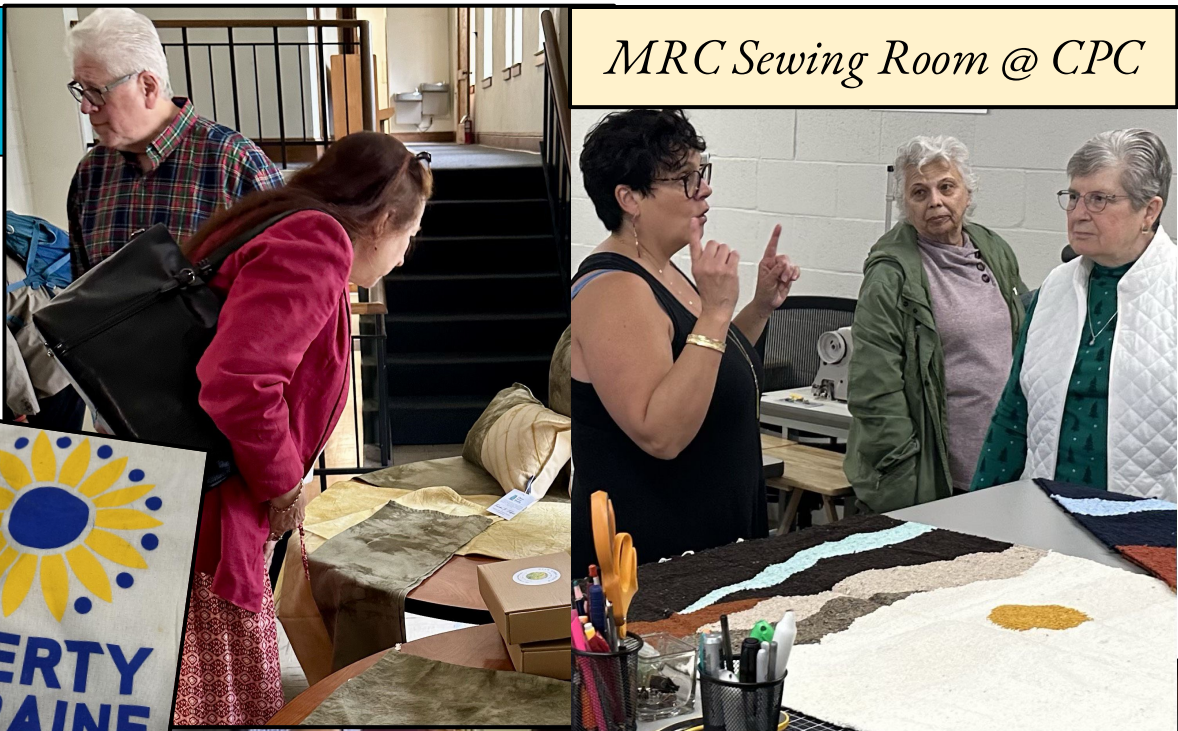
MRC Sewing Room @ CPC

The first Sunday in December we celebrated with two of our mission partners who operate out of our building, the Multicultural Refugee Coalition, MRC, and iAct. Representatives from Liberty Ukraine also joined us.