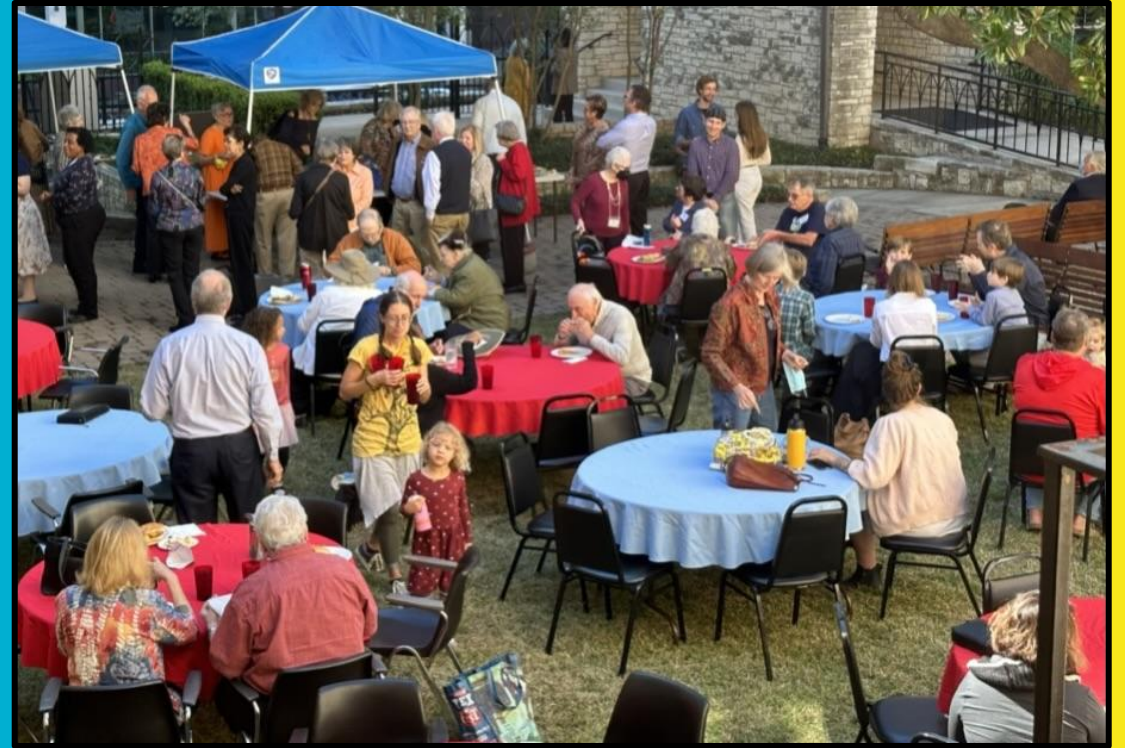
October Stewardship Luncheon